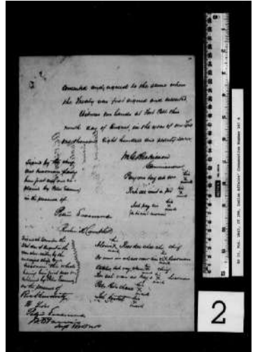
Adhesion to Treaty No. 6. Image courtesy of Library Archives Canada (GAD IT 299) Reference: RG10. Indian Affairs. D-10-a